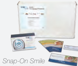
Snap-On Smile Value Kit