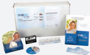
Snap-On Smile Starter Kit