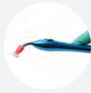
LumiGrip Gentle Veneer Delivery System