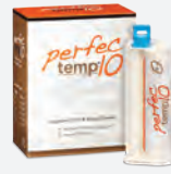
Perfectemp®10 Temporary Crown & Bridge Material