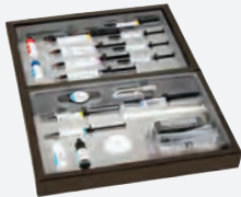
Lumineers Placement Kit