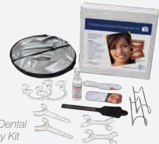
Professional Dental Photography Kit