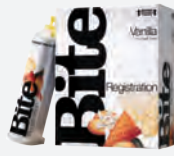
Vanilla Bite VPS Bite Registration Material