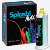
Splash®Max Super VPS Impression Material